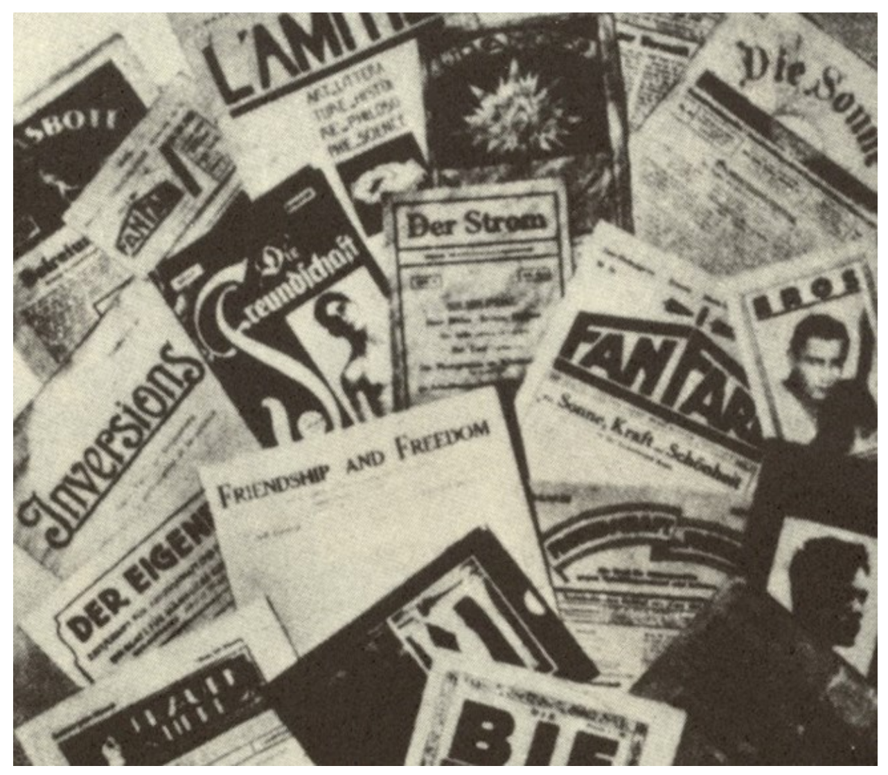
Image link: <u>https://www.nps.gov/articles/images/Friendship-2.jpg?maxwidth=650&autorotate=false</u>